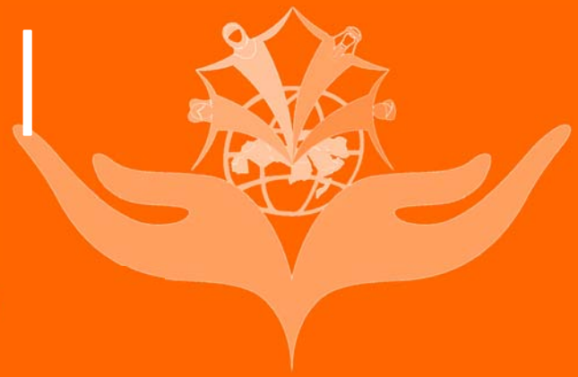
MYCHA International Participants by Nationality